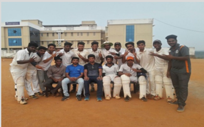
Cricket team secured third position in the B-Zone Cricket tournament